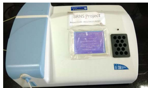
[Table/Fig-1]: Photograph showing collection of venous blood for the study. [Table/Fig-2]: Photograph showing centrifuge machine used for the biochemical analysis. [Table/Fig-3]: Photograph showing semi autoanalyser used for the study.

Patients with a history of any antibiotic/anti-inflammatory therapy in past three months prior to the study or having a history of any systemic disease or condition, subjects who had undergone any periodontal therapy three months prior to study, pregnant/lactating women, smokers and tobacco chewers, subjects with history of vitamin, minerals and antioxidant supplements for more than three months and uncontrolled type 2 diabetes mellitus patients were excluded from the study.